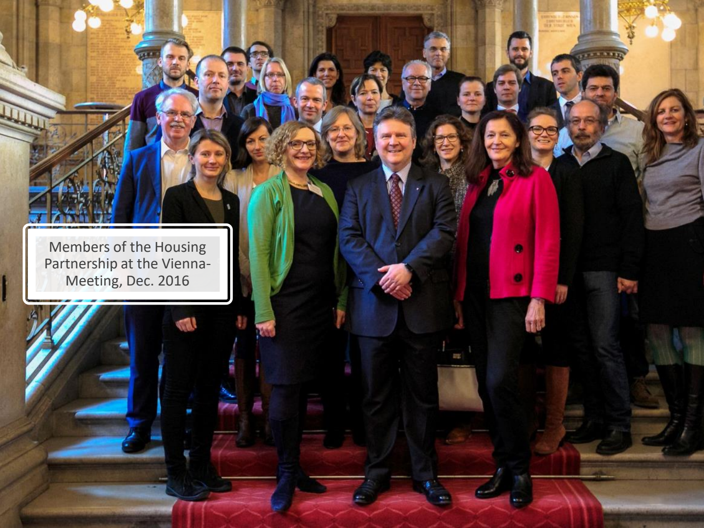
Members of the Housing Partnership at the Vienna Meeting, Dec. 2016