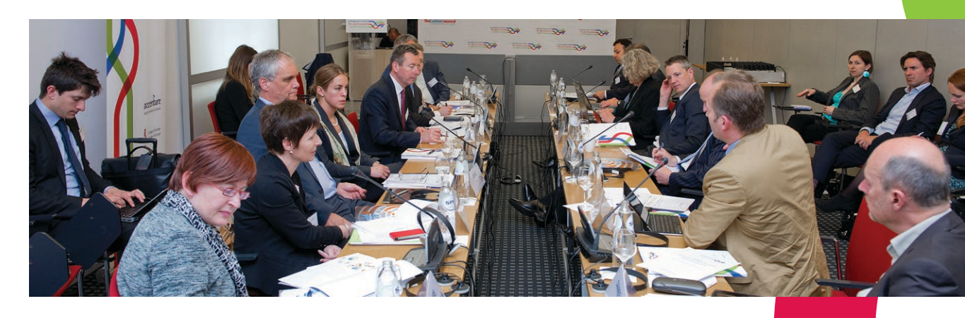
The 2015 Employment and Skills Roundtable on Building the Missing Skills in Europe to Rekindle Growth and Competitiveness

Research Study Driving Public Entrepreneurship: Government as a Catalyst for Innovation and Growth in Europe, published in collaboration with Oxford Economics