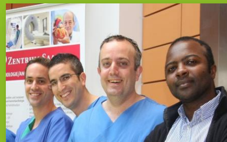
Strengthening of the medical staff