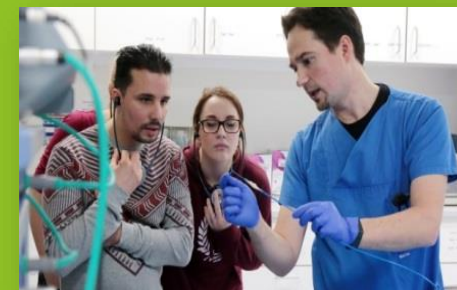
Promotion of professional and language exchanges