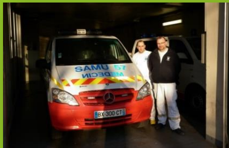
Optimization of time-critical care for patients with acute myocardial infarction

„The contracting parties decide to pool their efforts and competences in order to contribute to improving cardiac care, especially in emergency care, for the population of the Lorraine coal basin.“