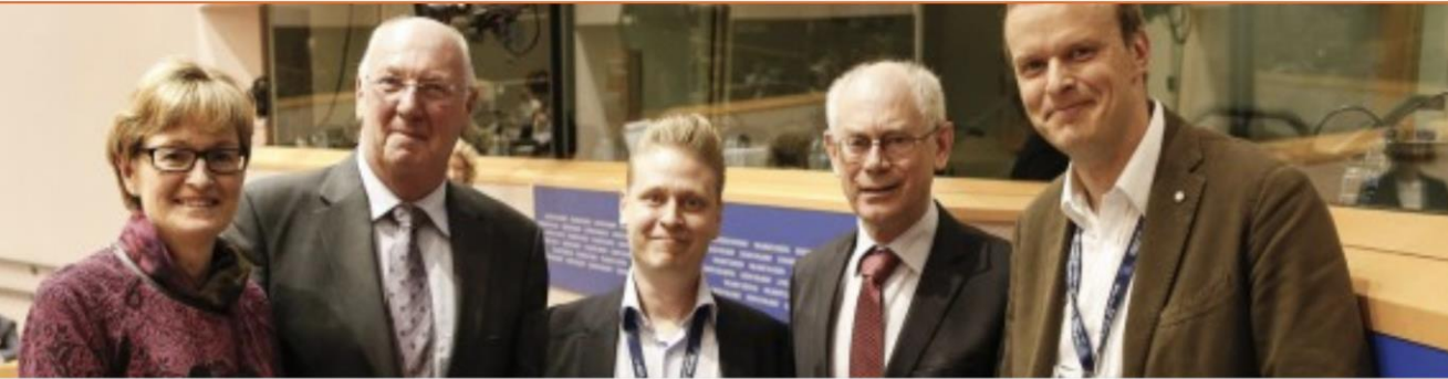
THE EUROPEAN PUBLIC COMMUNICATION AWARD 2014 ATTRIBUTED TO FAKTABAARI